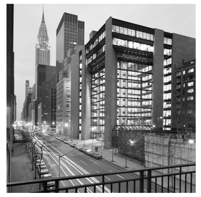
Ford Foundation Headquarters, New York.

n October, the Foundation's gardened headquarters building in New York City was the subject of heightened attention triggered by a new book on its architect, Kevin Roche.