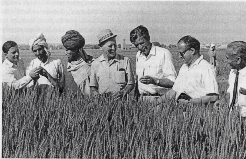
In an Indian wheat field, Norman Borlaug (fourth from left) meets with scientific colleagues and Punjabi farmers. Second from right is M.S. Swaminathan, later director of the Indian Council of Agricultural Research and Director-General of the International Rice Research Institute.

Winning the support of Ford's board was the first and necessary step. Ford had launched a large, influential rural development program in India in 1951, but with disappointing results in increasing agricultural production. In 1959, moreover, as Indian food production reached a crisis stage, a Foundation-supported study recommended emergency action. After visiting