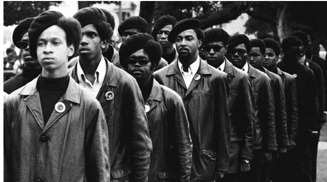
From The Black Panthers: Vanguard of the Revolution .