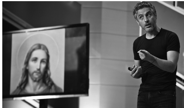
Reza Aslan’s talk “The Jesus of History versus the Christ of Faith”