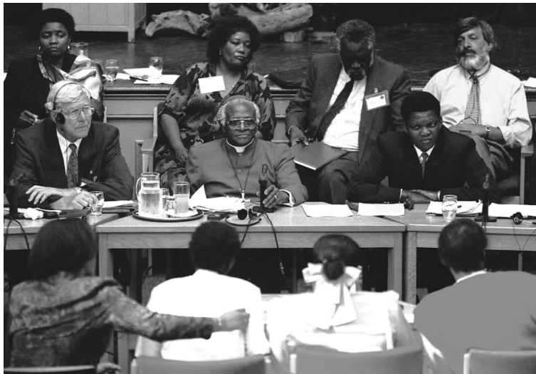
In the years immediately before the transition to democracy in South Africa, several Ford Foundation grantees played crucial roles in envisioning, and then contributing to drafting, the country's new constitution and establishing the founding principles of the Truth and Reconciliation Commission. Archbishop Desmond Tutu, center at table, at a commission hearing.

The above brief outline indicates the rich organizational structure that has developed to serve the independent sector in one country,